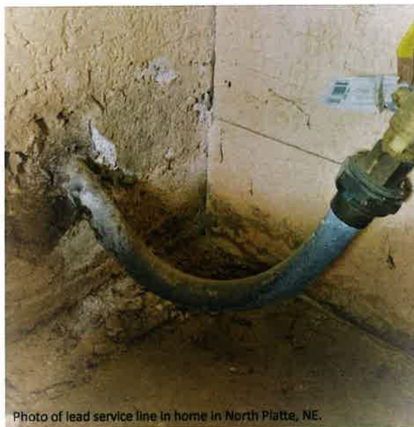
Photo of lead service line in home in North Platte, NE.

Check your records. Have you completed maintenance on your service line? Do you know when your home was built? If your home is older than 1988 and has the original service line or plumbing, then your home may have a lead service line or a lead component.